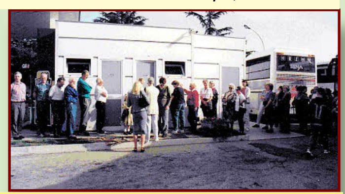
Mind your P's and Queue