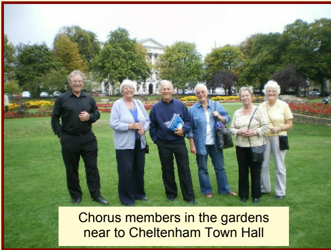
Chorus members in the gardens near to Cheltenham Town Hall

Each concert had supporting events. Well-known figures from the world of current affairs took part in discussions and presentations. In Poole there was a visual art project associated with the project supported by Poole Borough Council. Bournemouth's Library Service and the Russell Cotes Museum also arranged exhibitions.